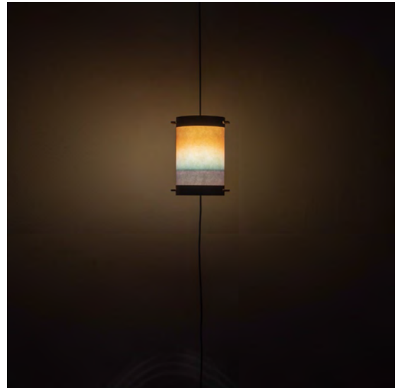
M2 - Meri - In Exhibition