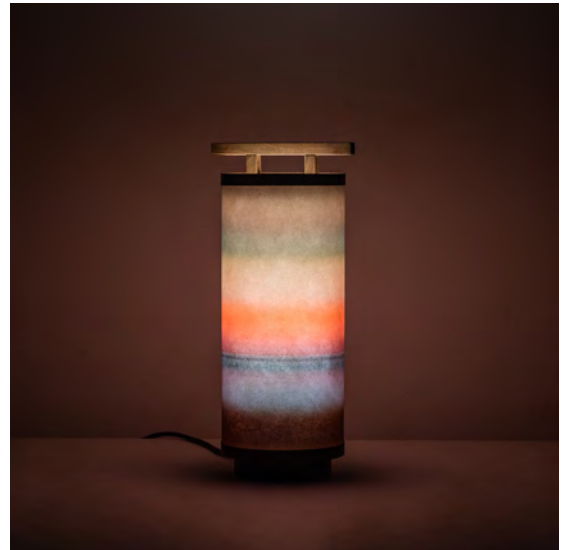
Tarn - In Exhibition