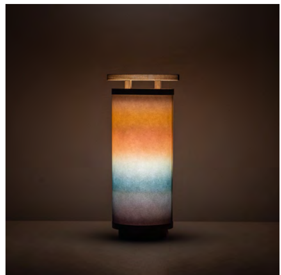
Avay - In Exhibition