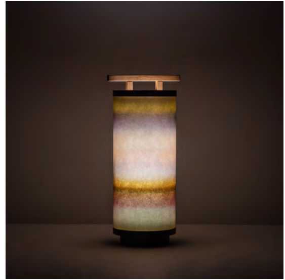
Affi - In Exhibition