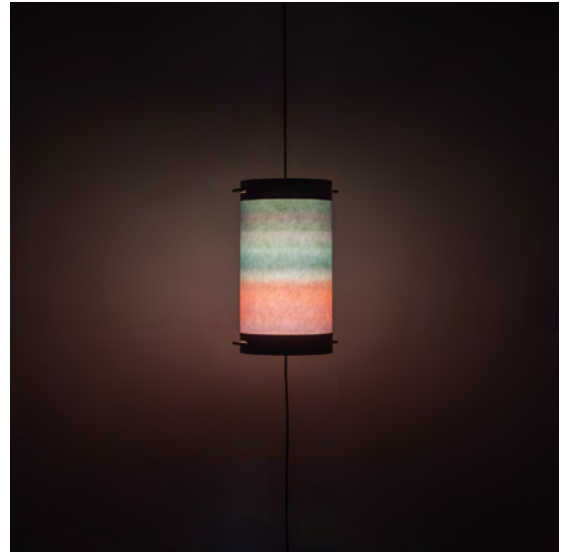
G3 - Pany