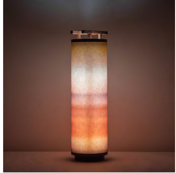
Arès - In Exhibition