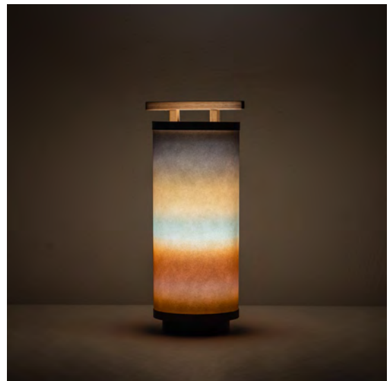
Guet - In Exhibition