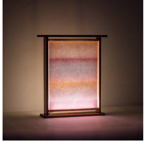
Grau - In Exhibition