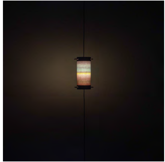
P2 - Pina - In Exhibition