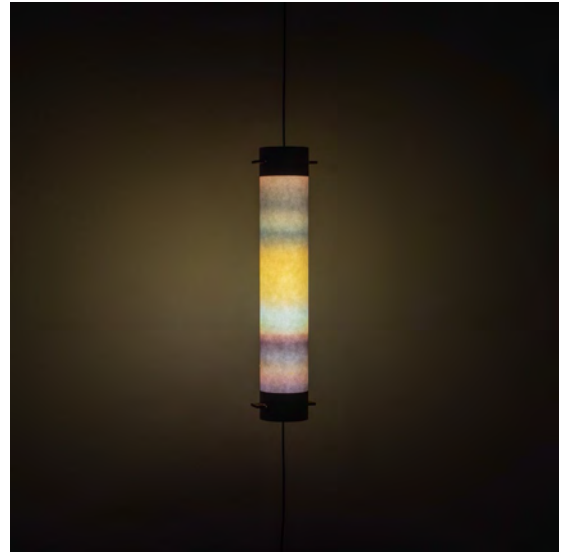
P5 - Biza - In Exhibition