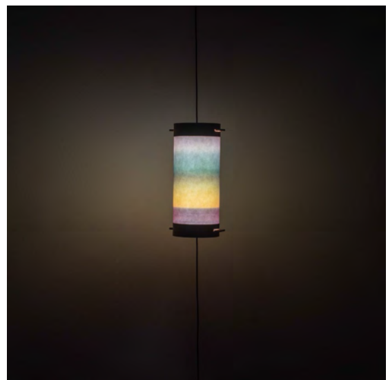
M3 - Raud - In Exhibition