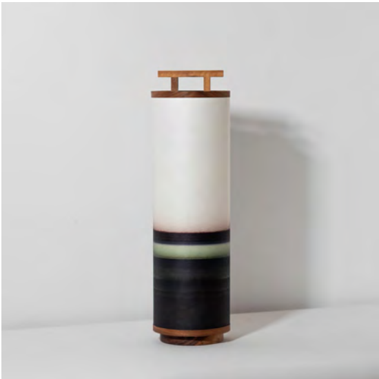
Mora - In Exhibition