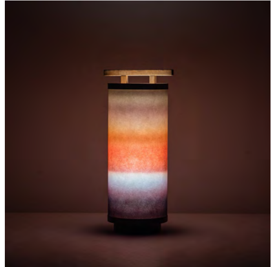
Cafr - Sold