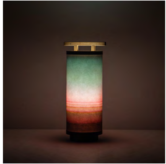
Reqi - In Exhibition