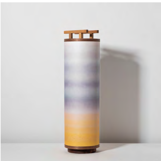
Anau - In Exhibition