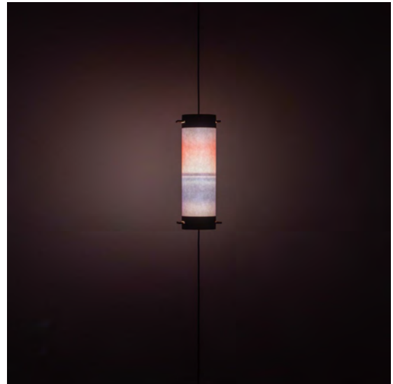
P3 - Dome - In Exhibition