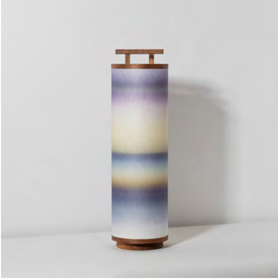
Pala - In Exhibition